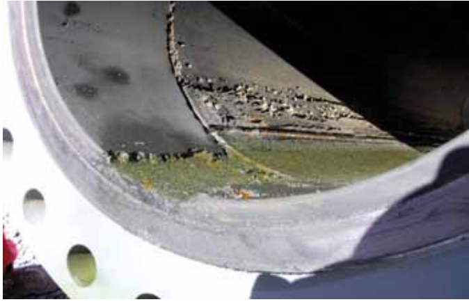
Shown is an example of localized corrosion observed in pipelines caused by sweet (CO<sub>2</sub>) corrosion.

Monitor (RPCM<sup>†</sup>) and field signature method (FSM) in situ spool technologies that can integrate or multitask with other acoustic and ER sensors as well as intelligent pigging. The challenge is placing the monitors at the most effective locations.