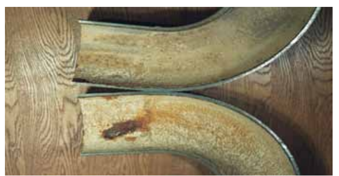
Shown is a failed manifold on a fixed platform due to an isolated erosion defect.

Pipeline CS is the most widely used material of choice because the industry has significant knowledge and experience associated with it, and it is cost efficient at the fabrication stage. But, Singh points out, such steels are also the most susceptible to corrosion, especially when exposed to seawater, reservoir fluids, and production fluids. If systems are going to be too corrosive, he says, then other, more exotic materials need to be considered, such as the CRAs (stainless steels, duplex, and nickel alloys). Using a more corrosionresistant material, however, can increase initial project costs to anywhere from three to 10 times higher than the cost of using CS. The use of CRAs for cladding or lining within segments of subsea infrastructure, such as high-temperature portions, flexible risers, or jumpers, is often justifiable. "It's a balancing act," says Singh, explaining that over conservatism